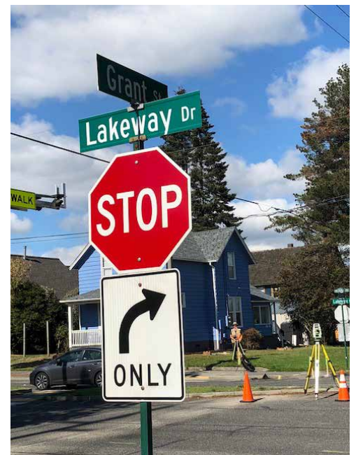
Lakeway Drive and Grant Street intersection gets surveyed in preparation for a new HAWK bicycle-pedestrian crosswalk.

As part of this project, a second crosswalk will be installed on Samish Way in south York at Otis/Maple and Samish Way. Shared lane markings on the new bike boulevards will connect to the bike lanes on Meador Avenue (south York) and to the Bill McDonald Parkway (near Sehome Village). To view the project map, go to: www.cob.org/photos/Government/PW/ES-0538-WEB.jpg .