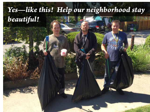
City Gate Apartment residents pick up trash once a month in York. Thank you, guys, for your important community service.